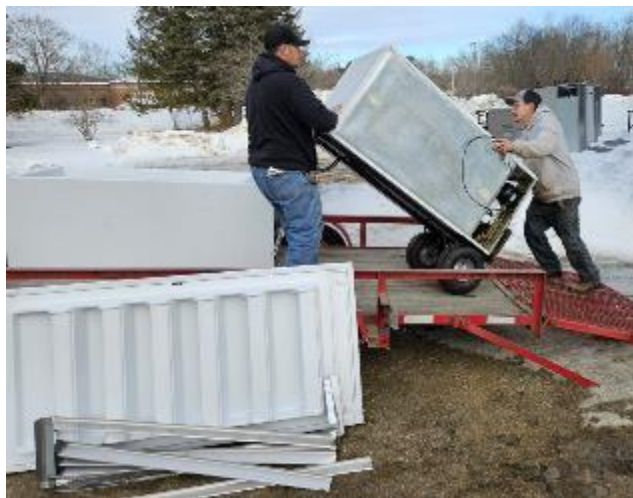
All freezers & fridges are removed.