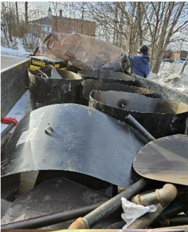
Oil tanks cleaned, then cut up, and removed from crawl space area. Thank God they were removed before the fire! Fire pictures on next page.