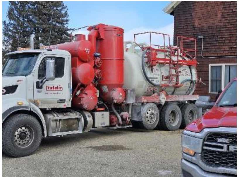
World's Largest Shop Vac!