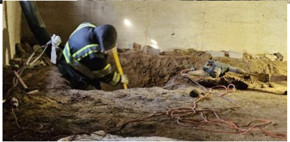
Step 2 ~ of soil removal. Step 3 ~ soil removed by truck!