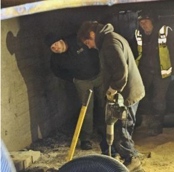
First step ~ jackhammering frozen, oil contaminated, soil.