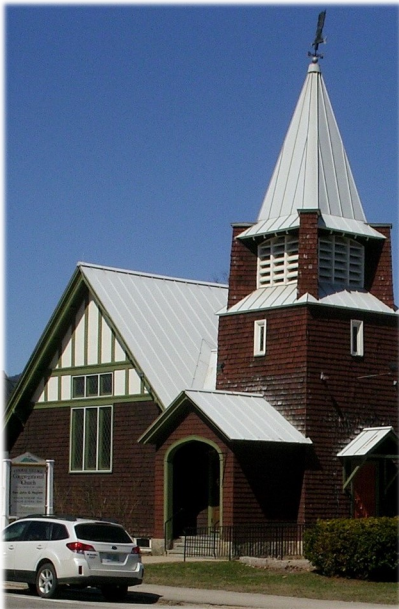
Over 110 years later