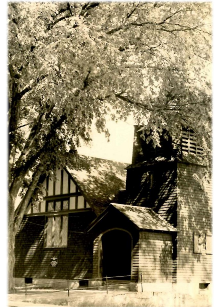
Pre-1911 photo of the Second Congregational Church