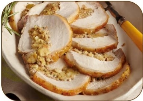
Stuffed Roast Pork Dinner $15.00

Pick up Wed. November 10 th 4:30 to 6 PM Available by Pre-Order Only By November 6 th