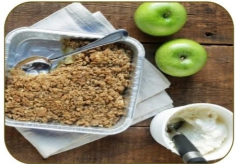
Pan of Apple Crisp $20.00

Pick up Wed. November 10 th 4:30 to 6 PM Available by Pre-Order Only By November 6 th