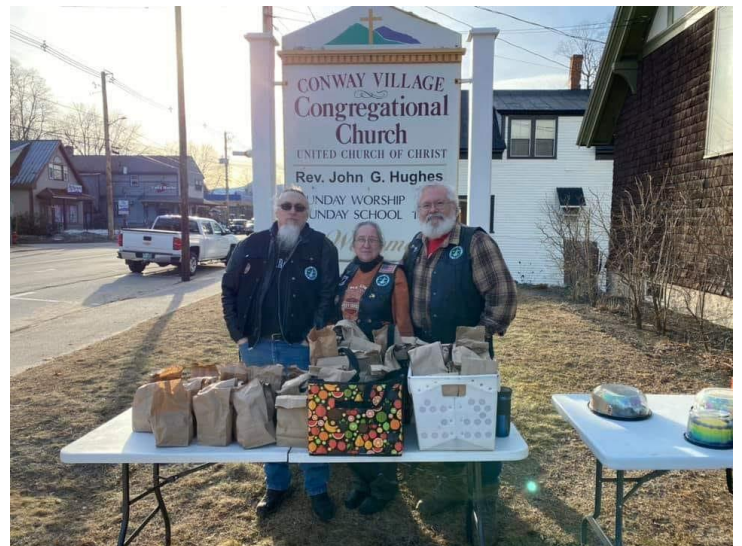
The Dinner Bell is now back open – serving take-out meals only, at the front entrance.